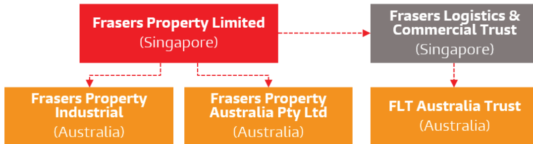
Figure 1: Frasers Property's business structure, as relevant to this Modern Slavery Statement. With the relevant functions shared between them, this Statement covers Frasers Property Australia, Frasers Property Industrial's operations in Australia and FLT Australia Trust.

Each company has a CEO and Executive Leadership Team, projects (new development) and owned assets (tenanted buildings).